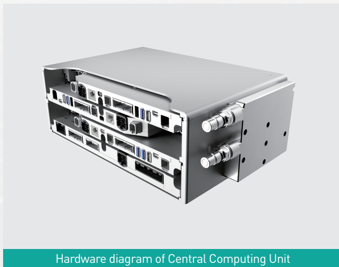
Hardware diagram of Central Computing Unit