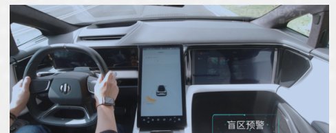
Blind Spot Warning