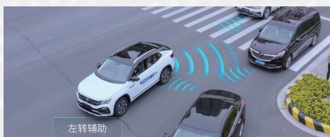
Left Turn Assist