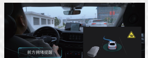
Traffic Jam Warning