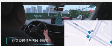
Vulnerable Road User Warning