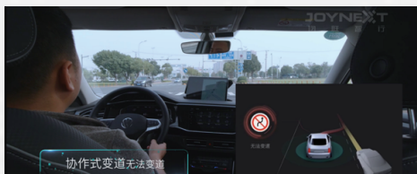
Collaborative Lane Change