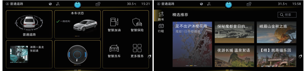
In-vehicle infotainment system: Dual OS system of Linux + Android